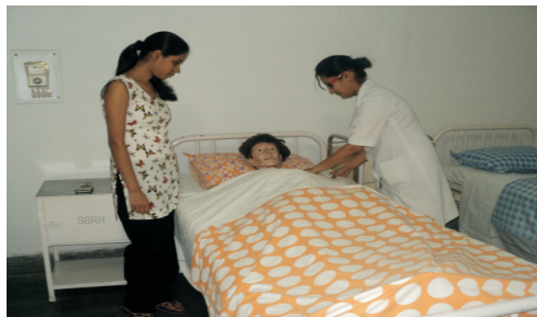
Nursing Foundation Laboratory