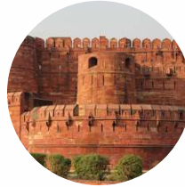
Agra Fort (closed on Monday)

Agra, the city known for the Taj Mahal, the legendary monument of love - is the single most famous tourist destination of India. Approximately 210 kms from south of Delhi, Agra is located on the west bank of the river Yamuna. The architectural splendour of the city is reflected in the glorious monuments of medieval India built by the Mughals who ruled India for more than 300 years.