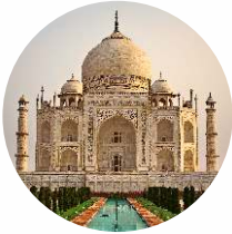
Taj Mahal (closed on Friday)

Agra, the city known for the Taj Mahal, the legendary monument of love - is the single most famous tourist destination of India. Approximately 210 kms from south of Delhi, Agra is located on the west bank of the river Yamuna. The architectural splendour of the city is reflected in the glorious monuments of medieval India built by the Mughals who ruled India for more than 300 years.