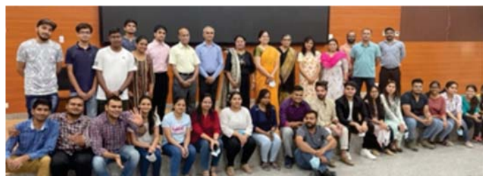
At NSUT Lecture Theatre, Dwarka (with senior faculty members and students)