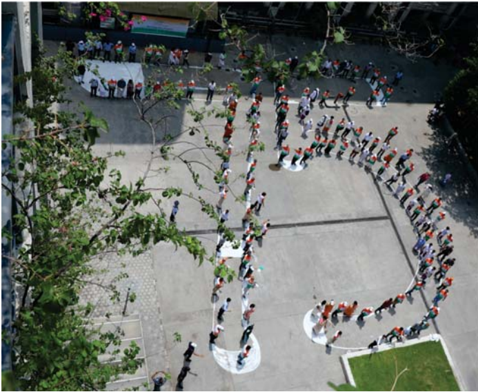
Consultants of SGRH celebrating 75th Azadi Ka Amrit Mahotsav after unfurling of tricolour by making a formation of number seventy-five as seen in the picture