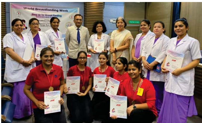
World Breastfeeding Week was organized by the Indian Academy of Pediatrics in association with the Department of Neonatology, SGRH